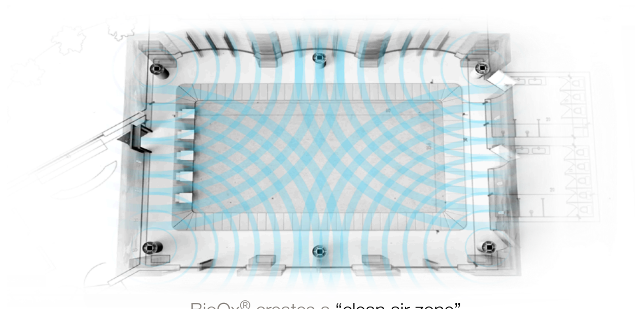
BioOx ® creates a “clean air zone”

BioOx ® are small machines that sit discretely in the corner of the room and plug into standard electrical outlets. They contain a mixture of plain water and natural enzymes. Within just a matter of hours of turning on your bio-reactor your air will be cleaner and healthier, and feel fresher as a variety of harmful particles are removed.